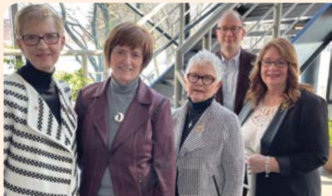
The delegation meets with representatives of the Canadian Conference of Catholic Bishops, February 2023.

Throughout three days of meetings, the League's delegation felt the prayerful support of members in that they had been well received and all dialogue had been fruitful. The delegation was pleasantly surprised and appreciated that, in several instances, the designated officer to meet on behalf of a minister was also Catholic. The League received several commendations for members' volunteer work and advocacy. The delegation left Ottawa convinced the League's advocacy through resolutions is valued and necessary to bring Christian perspectives and values to elected government officials and legislation. The delegation embraced its role as ambassadors for Christ, and its visit to Ottawa was a witness to being Catholic and Living It! †