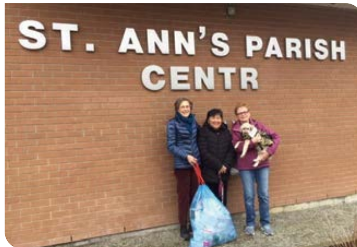
Members of the bottle drive team from St. Ann Parish Council (Abbotsford).

Members embraced the challenges during the pandemic, welcoming technology to keep the League alive and venturing into farm work and creative ways to fundraise to support charities. They continued to find ways to nourish their faith and research legislation supporting the vulnerable. The Lord continues to bless the council as members sincerely ask for His mercy and grace as they recite the League Prayer daily. For that, members are very grateful. They strive to make their hearts a dwelling for our Lord, embracing Christ in everyone and being Catholic and Living It! †