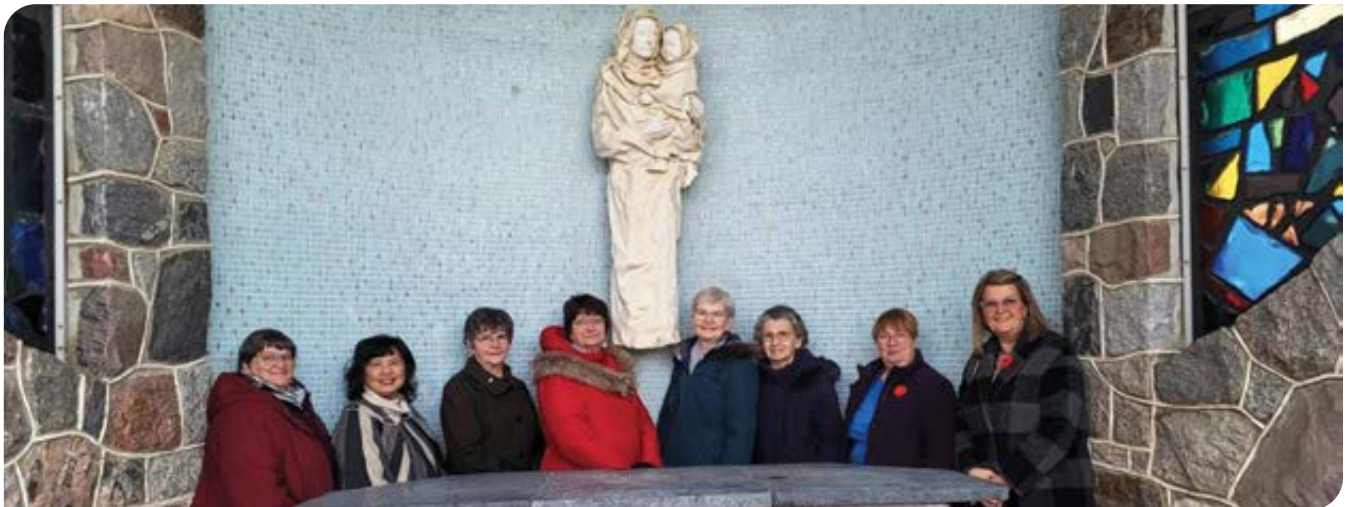
Members of Saskatoon Diocesan Council.

O Holy Spirit of God abide with us; inspire all our thoughts; pervade all our imagination; suggest all our doings. Be with us in our silence and in our speech, in our haste and in our leisure, in our company and in solitude; in the freshness of the morning and in the weariness of evening; and give us grace at all times, humbly to rejoice in your mysterious companionship, through Jesus Christ, our Lord. Amen" ( Healing Grace ). †