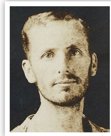
Image of Ben Salmon.

To learn more about the movement inspired by Ben Salmon, visit bensalmon.org/ .