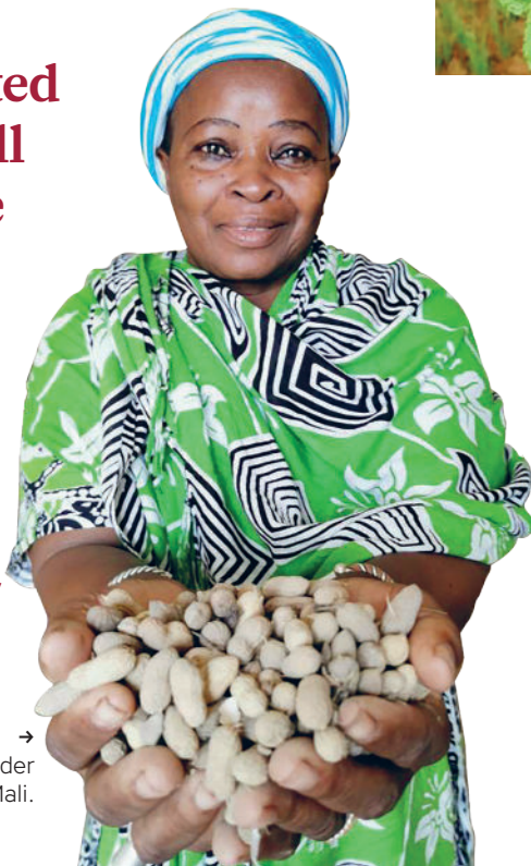
A local project leader in Farakala, Mali.