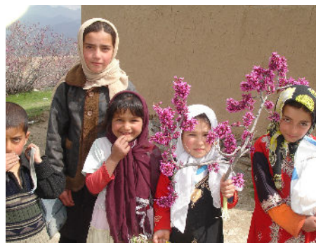
Children photographed during a 2012 mission to Afghanistan.

Girls' education is essential to promoting women's rights and recognizing the contribution of women to the well-being of their communities and society.