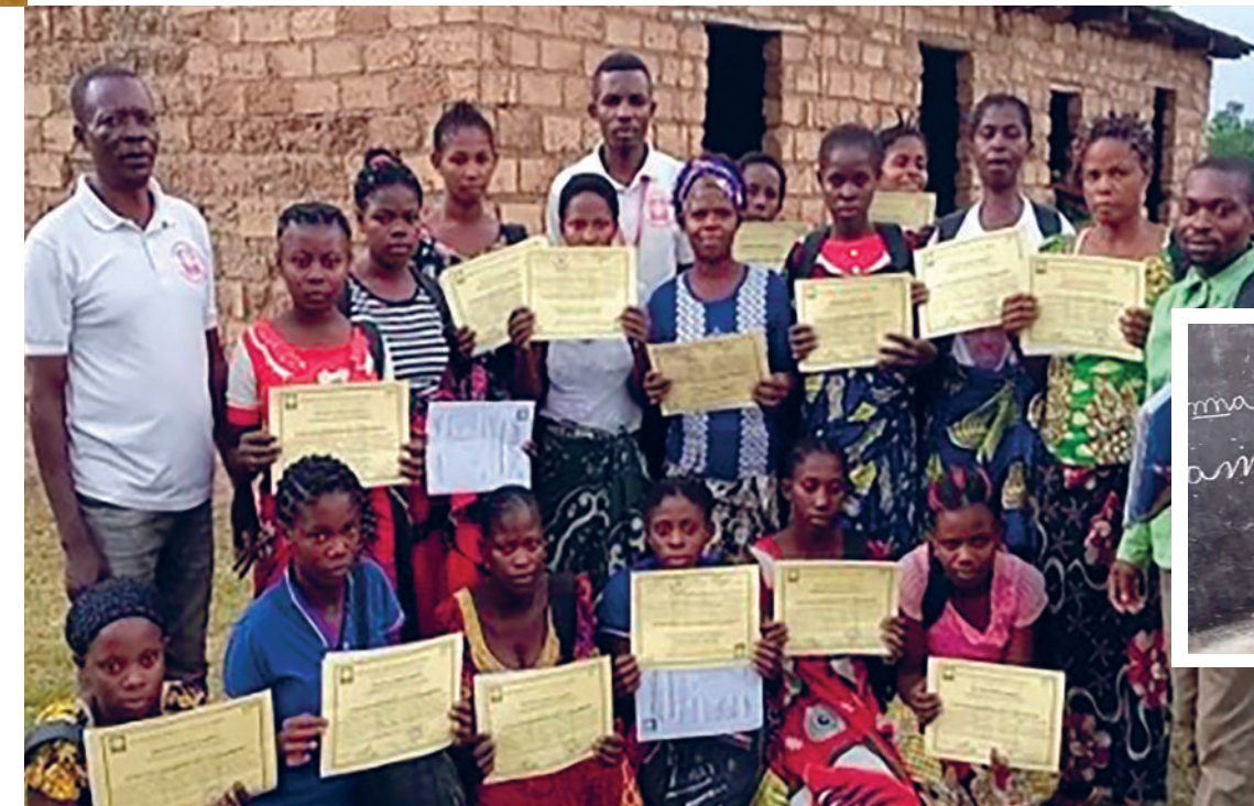
← Participants in the program receive their literacy certificates in the village of Ngonga.

Given its success, the project has been extended so that at least 200 more women can enroll in the program! And that number does not include their families and communities, who comprise the thousands of indirect beneficiaries!