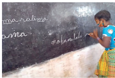
↑ A program participant writing in Swahili.