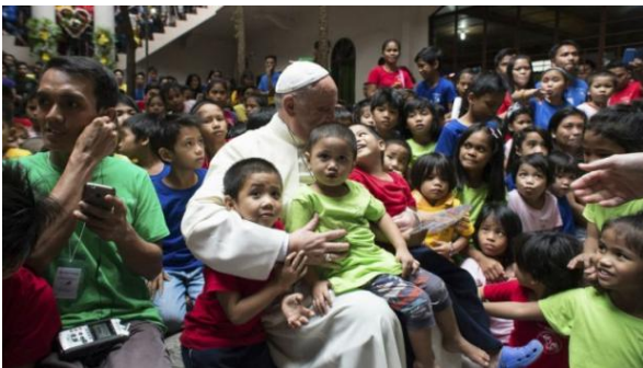
Pope Francis paid a surprise visit to the Jesuit orphanage in Manila,