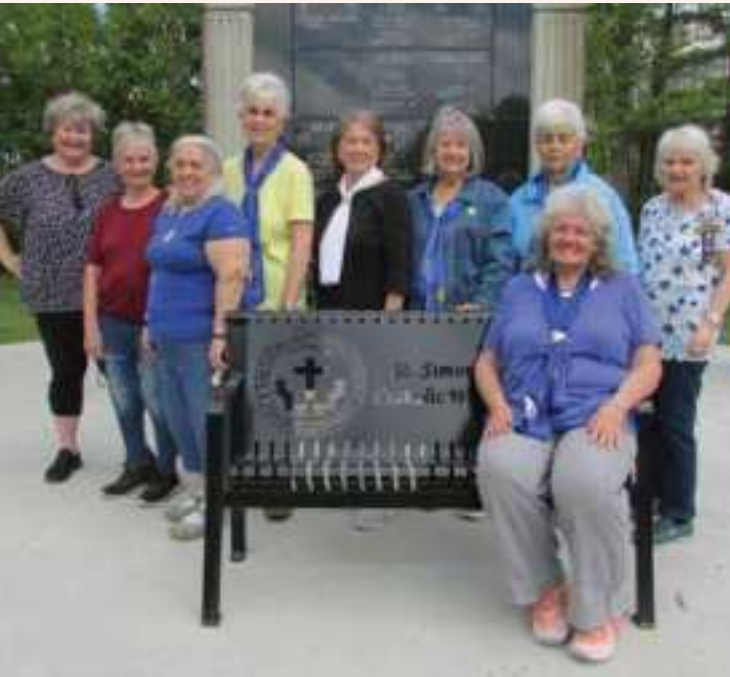
St. Simon & St. Jude Parish Council, Belle River, Ontario – St. Simon & St. Jude Parish Council commemorated the 200 th anniversary of the parish cemetery with a park bench to honour the legacy of their deceased members. The council is thankful that the members and council will be memorialized in this sacred place. A Mass will be celebrated by Bishop Ronald Fabbro (London) on September 7 th , with the new park bench to be blessed.